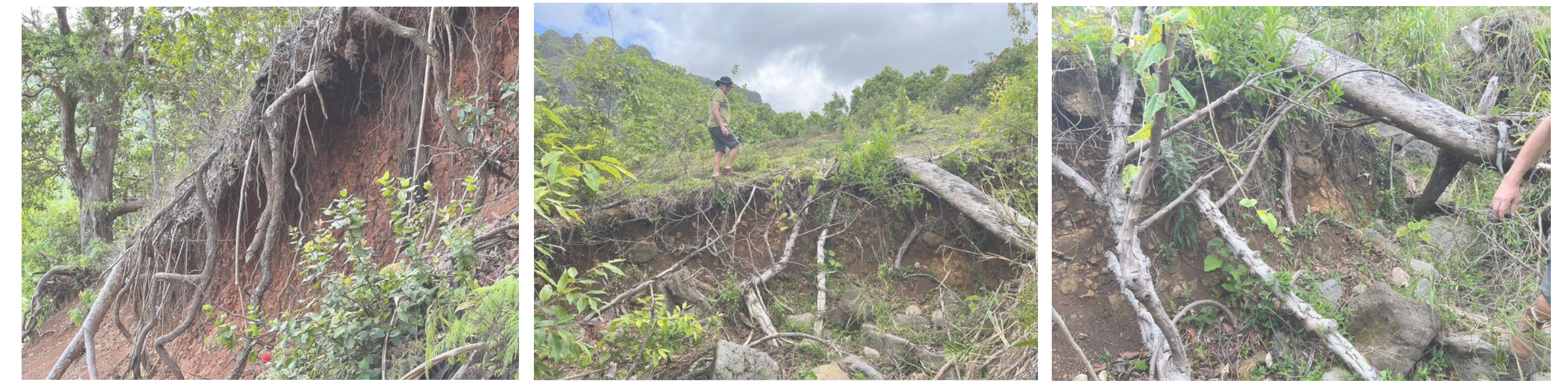
REFERENCE FOR ROOTS AND VINES. DRESS PLATFORM AND SURROUNDING AREA COMPLETELY. DISCUSS WITH ART DIRECTOR.